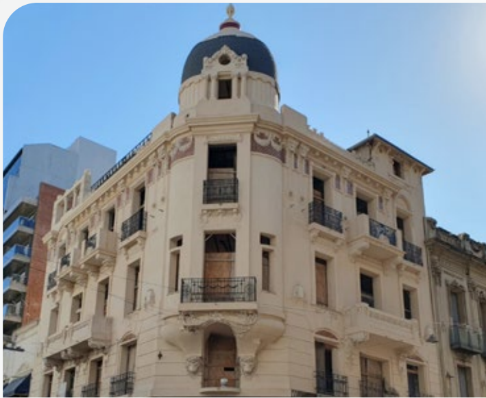
OFFICE BUILDING RESTORED TO ENVIRONMENTALLY FRIENDLY STANDARDS